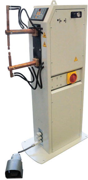
TECNA® 4648 Pneumatic Spot Welder