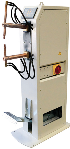
TECNA® 4643 Foot-Operated Spot Welder